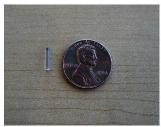
Final product size comparison.